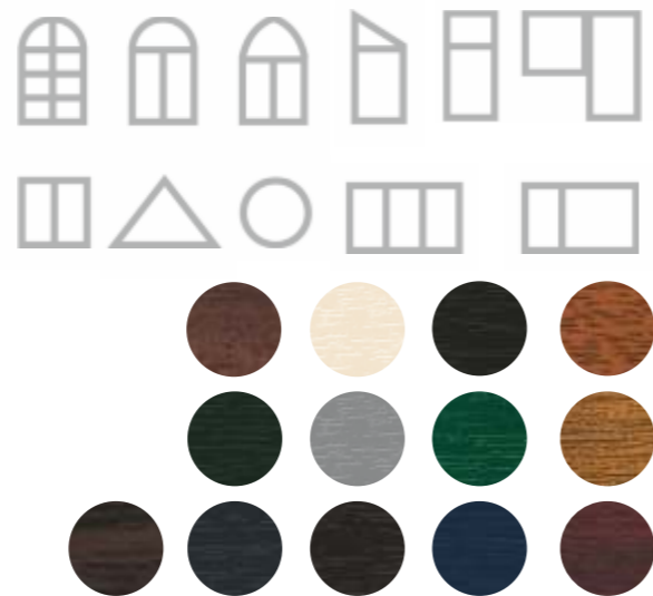
"KBE" window systems with the outer sealing, which is 70 mm wide.