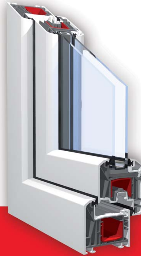
Use of recycled material in the 70 mm standard system

The use of recycled material in our 70 mm standard system underscores our confidence in this subject. Recycled material is not visible in the finished window, and there are no differences in quality.